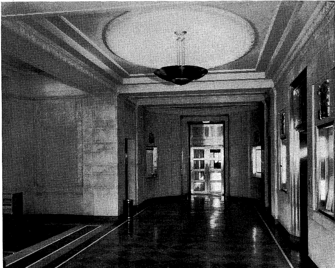
Entrance Lobby—Natural Resources Building.

As this is written, the Division of Architecture and Engineering is hard at work on contract drawings for the additions to the present building, virtually completing the group. After the war when labor and materials are available, Illinois will be ready to begin construction at once and when completed will have a plant second to none in this field. What its problems of the future will be no one really knows or can hardly guess. The horizon is limitless. Some day a new use for some material or plant will be discovered in one of these laboratories and a whole new industry will be born! Others are sure to follow. Our Division is extremely proud of its part in the development of this scientific group of buildings and feels it has had at least a small share in the development and future growth of our great state.