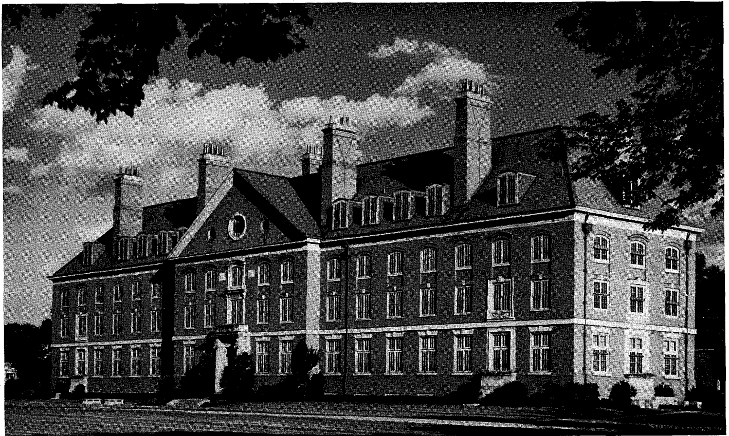
Natural Resources Building, University of Illinois Campus, Urbana-Champaign. Completed 1940.

Illinois is now well equipped to learn more about her resources. The Natural Resources Building, occupied by the State Geological and Natural History Surveys, on the campus of the University of Illinois, was completed in 1940. The completion of this structure concluded a vital period of planning and construction, important to the future growth and development of the State of Illinois. This period of planning began with the study of the purposes, aims and work of the two Surveys, an examination of their meager existing and scattered facilities, and their desire to unify their services on one plot and largely under one roof, and ended with the completed structure, a "tailor-made" plant, ready for action. In between is the record of the assembling of technical and scientific requirements and the solution of endless knotty problems, resulting in a modern plant for the adequate study of the potential-